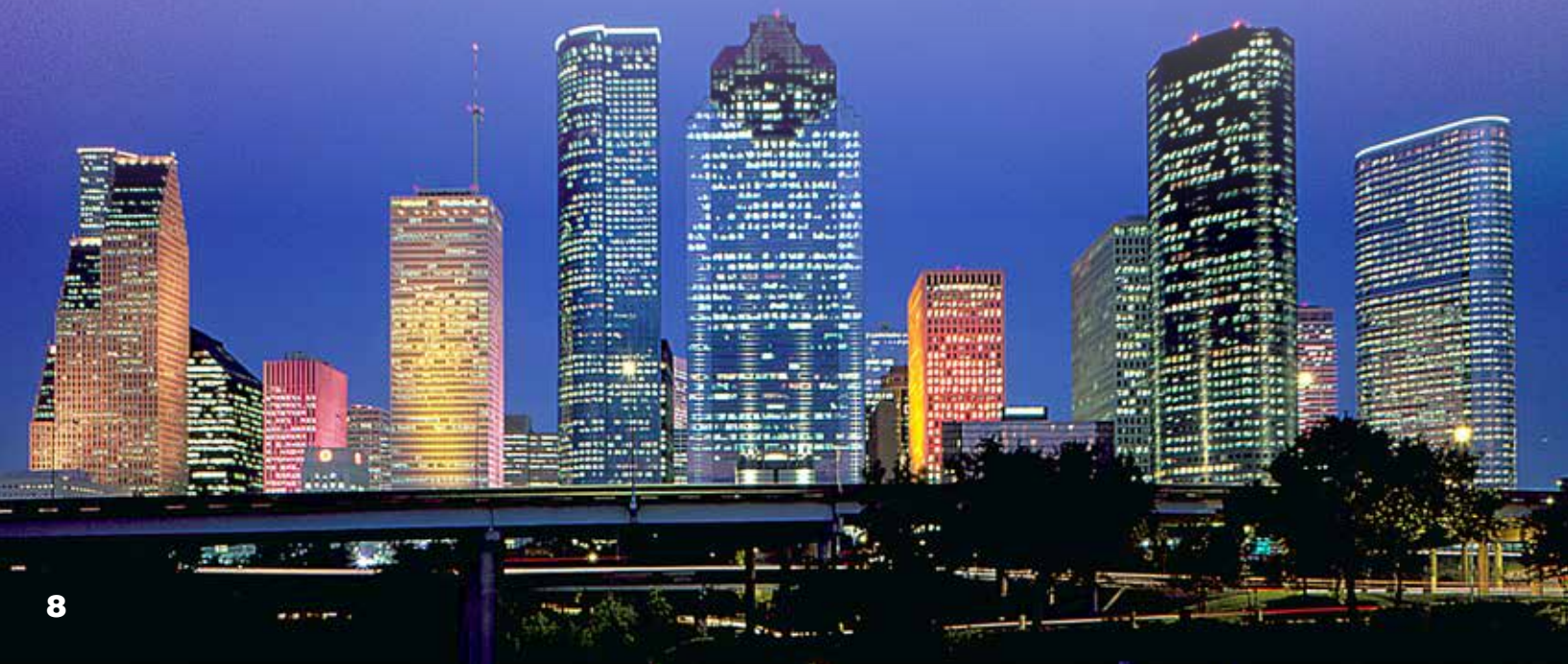
The Houston skyline at night

Pediatric Critical Care Pediatric Intensive Care of San Antonio San Antonio, TX